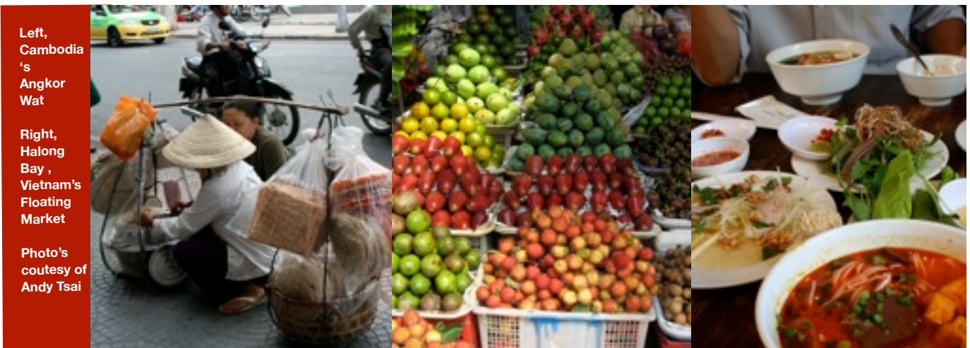
Left, Cambodia's Angkor Wat

During the two Indochinese Wars in the 20 th century Hanoi had been heavily damaged, but there is virtually no evidence of that now and the particularly thin, tall, often awkward-looking buildings that you see on streets are not a result of bombing, but are created by landowners who own only a thin slice of land. Hanoi has a number of lovely parks and big lakes which inspired the ancient architects to build graceful temples nearby, and Museums with precious exhibits of Vietnam's Fine Arts, Ethnology, History and Recent Wars that attract not only historians but foreign visitors and local people.